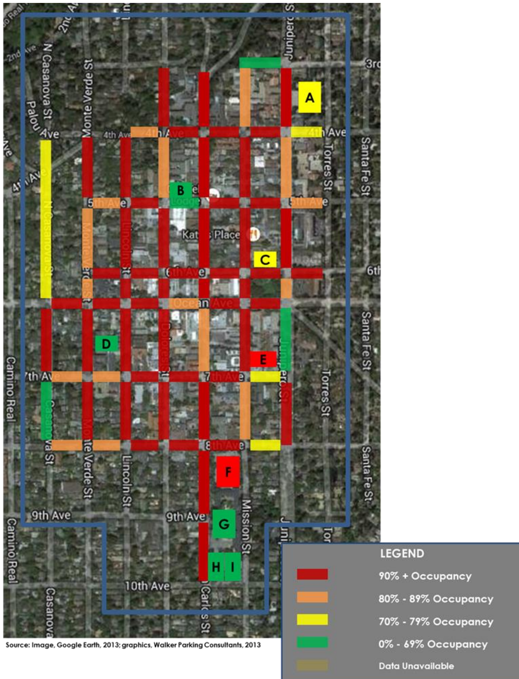
Figure 2: Peak Parking Demand on Saturday, July 13, 2013 at 2:00 PM

Figure 2 is a "heat" map that reflects the demand for parking during the period of peak demand. As will be explained in the following section, each red area indicates a location that, based on our experience and parking industry standards, was experiencing an unacceptably high parking occupancy rate.