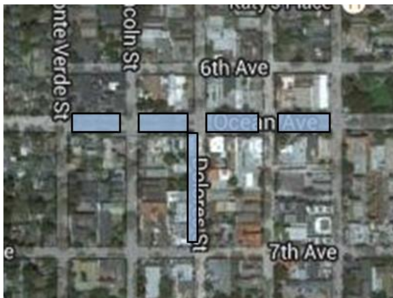
Figure 3: Map of LPI Area

For the LPI, field staff for Walker Parking Consultants recorded identifying license plate information from each car parked in the two LPI areas on an hourly basis with the first inventory starting at 10:00 AM and the last inventory starting at 8:00 PM. The LPI was performed on a weekday in July 2013.